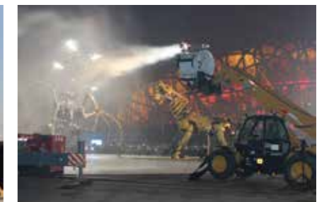
XCMG Telescopic Handlers Celebrate 50th Anniversary of Diplomatic Relations between China and France